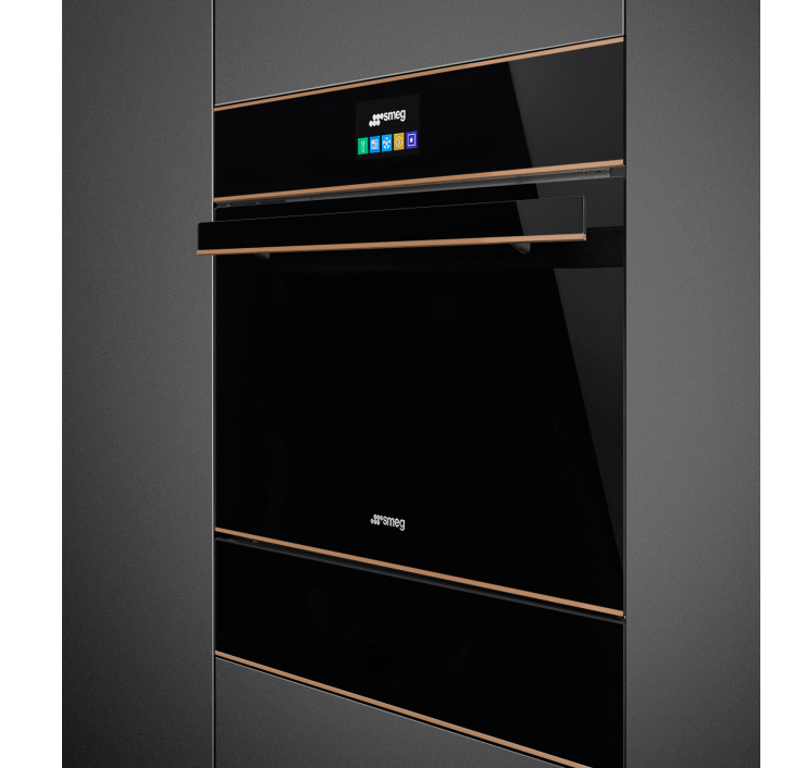
CP615NR shown below a compact oven

Smeg's Dolce Stil Novo collection presents uninterrupted lines, precision craftsmanship and elegance – beautiful yet purposeful appliances. The comprehensive collection features exclusive, beautiful and truly unique aesthetics with refined copper or stainless steel detailing. Partnered with leading technology and superior performance, they make the perfect addition to the modern and contemporary home.